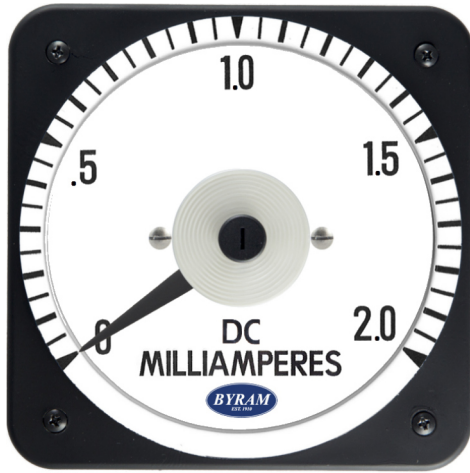
0-2 DC Milliamperes