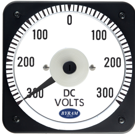
300-0-300 DC Volts