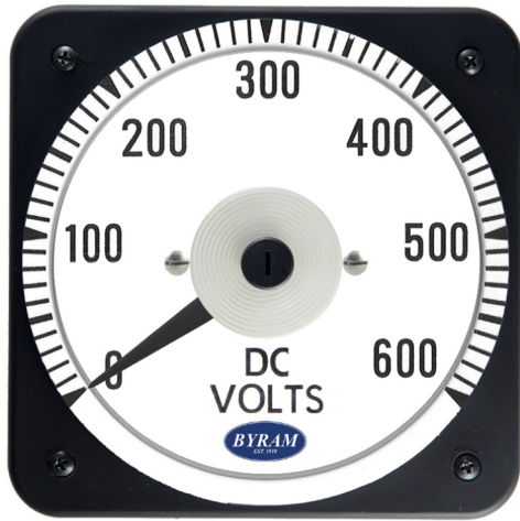
0-600 DC Volts