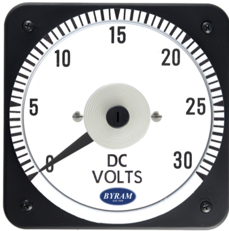
0-30 DC Volts