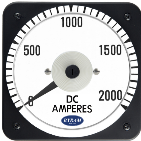
0-2000 DC Amperes Rating: 50 millivolts

Use with 50mV shunts and 0.05 Ohm shunt leads (standard 5-foot leads)