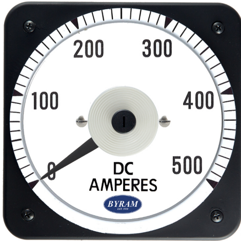
0-500 DC Amperes Rating: 50 millivolts

Use with 50mV shunts and 0.05 Ohm shunt leads (standard 5-foot leads)