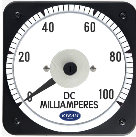
0-100 DC Milliamperes