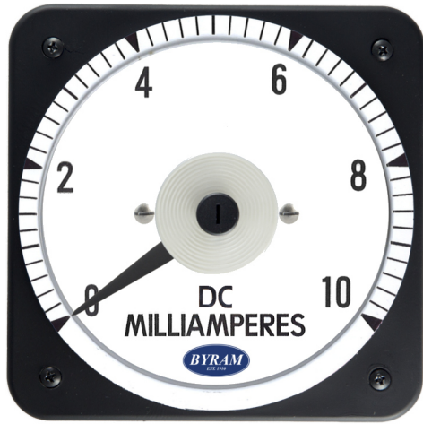
0-10 DC Milliamperes