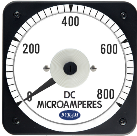
0-800 DC Microamperes