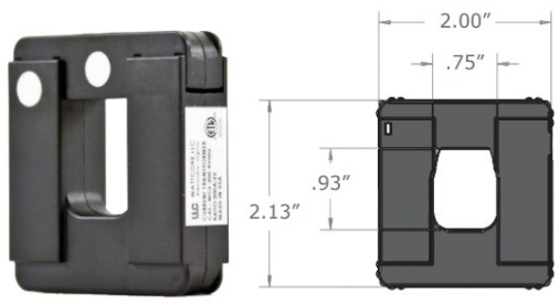
All Byram meters are shipped with matching transformer(s)