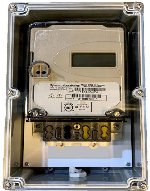
B10-3208200R Order Number: 1D2336

Each B10 meter is capable of being upgraded for remote metering** with additional options of Time of use, and load profile, and interval data.