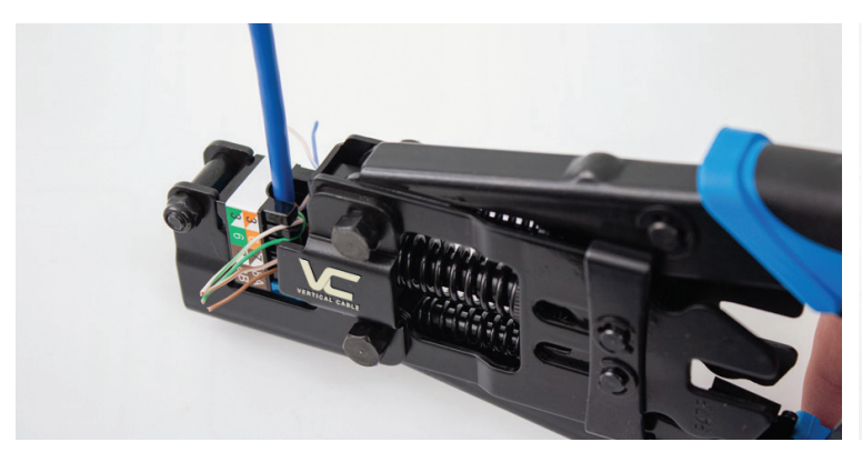
Insert prepared jack & cable assembly into the I-Punch Tool.

Remove up to 2 inches of the jacket from the cable with a cutter or a stripper. Separate all twisted pairs from each other. Preserve the wire pair twists as close as possible to the point of termination. Determine the wiring scheme and properly align all four cables accordingly on the jack. Keep the cable jacket as close to the connector as possible.