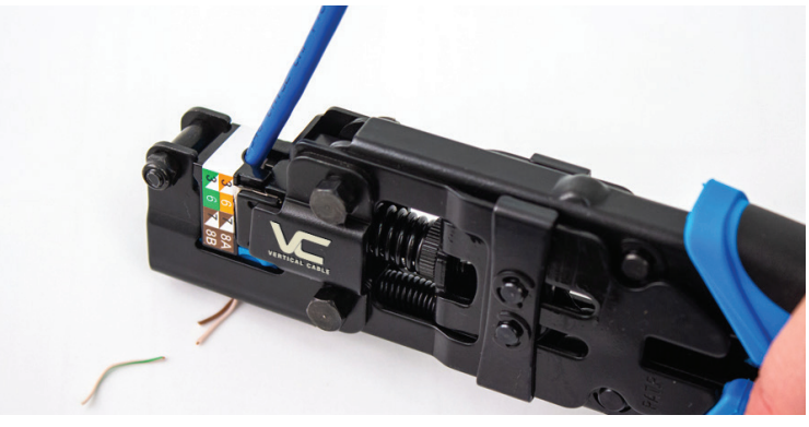
Firmly squeeze the handles together, release the handles and repeat this step to ensure a proper termination.