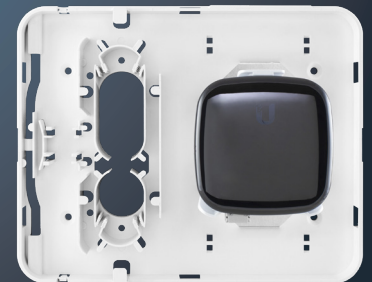
Ubiquiti® (U FIBER)