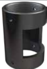
EC2: Pipe Connector with Opening for Cord Management