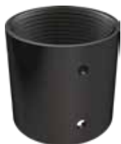
EC1: Pipe Connector