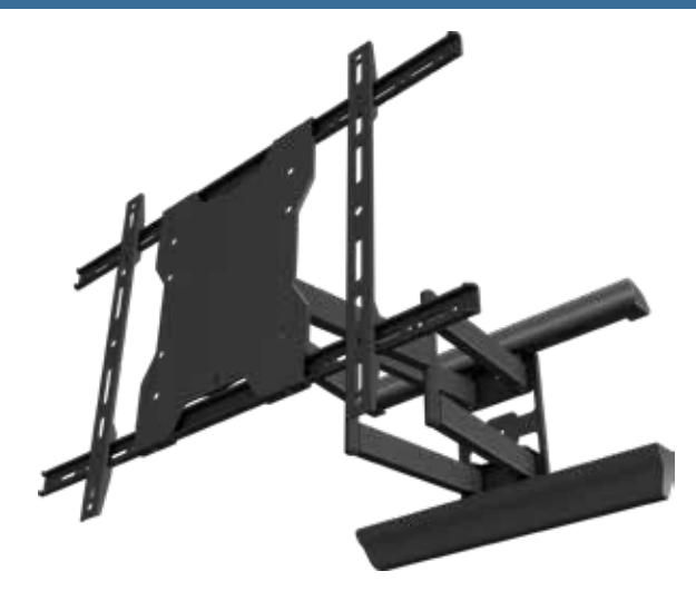
Articulating mount for 37" to 70" flat panel displays. Multiple joint arms hold display 2.5" from wall when retracted and 15.5" when fully extended. Smooth tilt adjustments of +15° (forward) and -5° (back) with a locking knob and 3° side-to-side roll facilitates a variety of viewing angles and perfect display positioning. Makes a secure installation quick and easy, simply hang the display and turn the pre-assembled securing screws to lock in place. Integrated cable management for clean look.