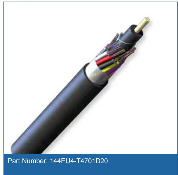
Part Number: 144EU4-T4701D20

Corning Cable Systems ALTOS® Cable with FastAccess™ Technology is an all-dielectric gel-free cable designed for outdoor and limited indoor use for campus backbones in lashed aerial and duct installations. The innovative FastAccess Technology feature combined with the all-dielectric gel-free loose tube design simplifies removal of the cable jacket reducing cable end access time by at least 50 percent. Equally important is the overall reduction in risk of inadvertent fiber damage and risk to installers from sharp cable access tools. The cable is fully waterblocked using craft-friendly, water-swallowable materials, which means no clean up is required. The flexible buffer tubes are easy to route in closures, and the SZ-stranded, loose tube design isolates fibers from installation and environmental rigors while allowing easy midspan access. The all-dielectric gel-free cable construction requires no bonding or grounding, and these cables have a medium-density polyethylene jacket that is rugged, durable, and easy to handle. A variety of fiber types are available including 62.5 μm and 50 μm, single-mode and hybrid versions, as well as fibers with Gigabit and 10 Gigabit Ethernet performance.