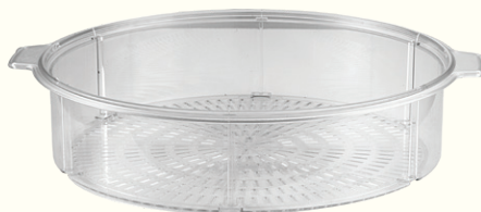
Steaming Baskets are available for this model

For moist, uniformly cooked rice, heat is evenly generated and distributed on bottom and sides of the heavy duty, removable anodized aluminum pan . A tight locking lid with silicone seal prevents drying, and ensures better tasting rice.