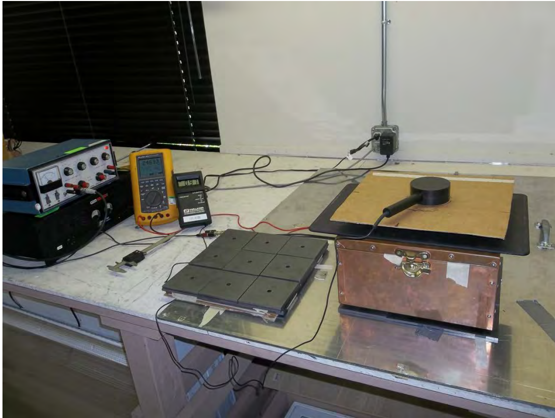
Figure 2. ELF EMR (Magnetic Component at 60 and 300 Hz) Test Configuration Photograph