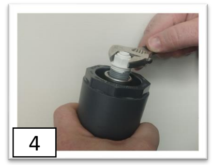
Thread ¼" Tube Fittings into each side of the HD Unit and use Wrench to tighten.