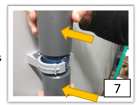
Press HD-9 Unit into Mounting Clamp until it latches in place.