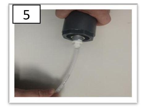
Route the Water Line from Reservoir to Bottom of the Unit. Insert and Push 1/4" Tube into the Bottom Fitting.