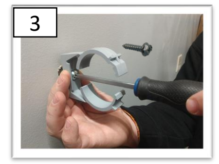
Use1/4" Wood Screw for Wood Installation. Pull on Toggle and Tighten Fastener until tight against the Drywall.