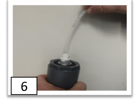
Insert and Push the ¼" Tube into Top Fitting. Route the Tube to the Faucet and connect.