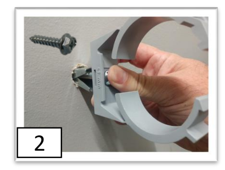
Insert Wood Screw through Clamp and Tighten. Insert Toggle into Hole for Drywall Installation.