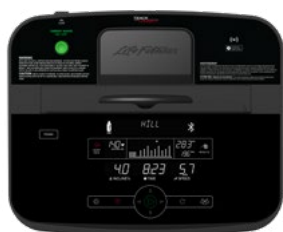
Track Connect 2.0 with Enhanced Bluetooth

Enable Bluetooth on your mobile device to push data to a growing list of partner apps for an engaging virtual workout experience.