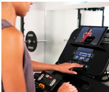
Track Connect 2.0 with Enhanced Bluetooth