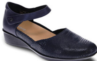
OSAKA Navy Lizard/Sapphire WAS $199.95 NOW $169.95