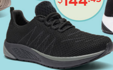
Men's + Women's Triple Black