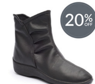
L19 Black WAS $219.95 NOW $175.95