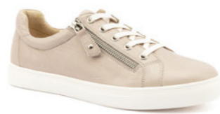
Cara Plain Dark Stone WAS $229.95 NOW $195.45