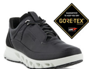
Multi-Vent Black WAS $399.95 NOW $339.95