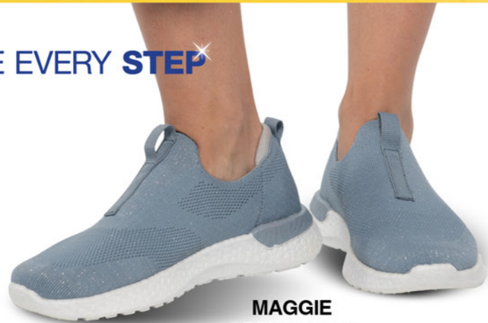
MAGGIE GREY SILVER WAS $109.95 NOW $93.45