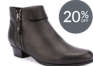
Xanthippe Black WAS $299.95 NOW $239.95