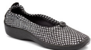
L14 Diamond Black/White WAS $159.95 NOW $135.95