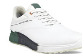
Golf S-three White WAS $379.95 NOW $322.95