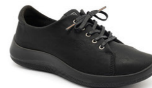
Daintree Black WAS $249.95 NOW $212.45