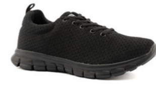
Kross Sport Double Black WAS $119.95 NOW $101.95