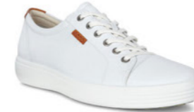
Soft 7 White WAS $289.95 NOW $246.95