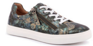
Cara Floral Blue WAS $229.95 NOW $195.45