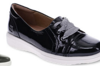
BRIDGETTE BLACK PATENT WAS $189.95 NOW $161.95