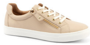
Cara Pebble Nude WAS $229.95 NOW $195.45