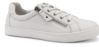
Cara Pebble White WAS $229.95 NOW $195.45