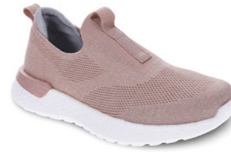
MAGGIE MAUVE SILVER WAS $109.95 NOW $93.45