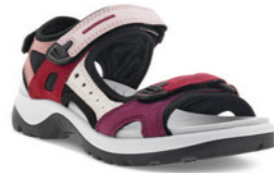
Offroad Multicolour Chili Red WAS $239.95 NOW $203.95