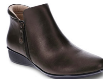
DAMASCUS Khaki WAS $229.95 NOW $183.95