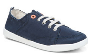
PISMO Navy WAS $99.95 NOW $84.95