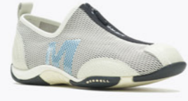
J577422 BARRADO WHITE/BEIGE WAS $149.95 NOW $99.95