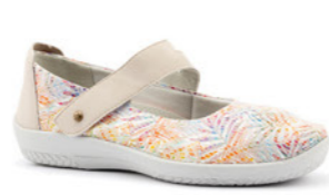
Cosmo Kokoa Taupe WAS $179.95 NOW $152.95