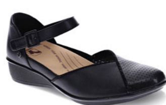
SURREY Black French WAS $199.95 NOW $169.95