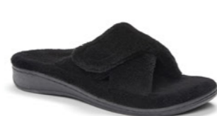
RELAX Black WAS $99.95 NOW $79.95