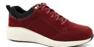
Kiama Red WAS $179.95 NOW $152.95