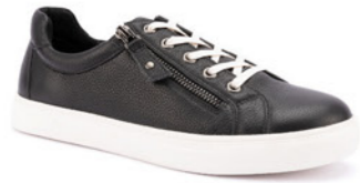
Cara Pebble Black WAS $229.95 NOW $195.45