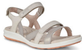
Cruise Silver Grey WAS $229.95 NOW $195.45