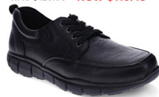
JACKSON BLACK WAS $159.95 NOW $135.95