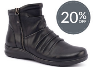
Jaxon Black WAS $279.95 NOW $223.95