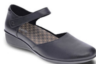
OSAKA Black French WAS $199.95 NOW $169.95