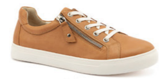
Cara Plain Coconut Tan WAS $229.95 NOW $195.45