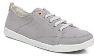
PISMO Light Grey WAS $99.95 NOW $84.95