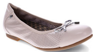
ST BARTS Pebble WAS $189.95 NOW $161.45