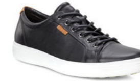
Soft 7 Black WAS $289.95 NOW $246.95