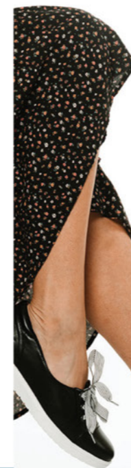
BRIDGETTE BLACK LEATHER WAS $189.95 NOW $161.95