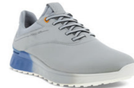
Golf S-three Concrete Blue WAS $379.95 NOW $322.95