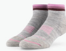
ZONED HIKING QUARTER LTGRY $19.99 SINGLE PAIR PACK