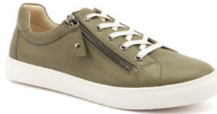
Cara Plain Light Khaki WAS $229.95 NOW $195.45