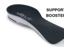
EVERYDAY COMFORT 3/4 LENGTH WAS $49.95 NOW $42.45