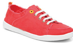
PISMO Poppy WAS $99.95 NOW $84.95