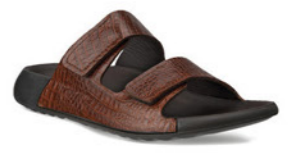
Cozmo Cognac WAS $209.95 NOW $178.45