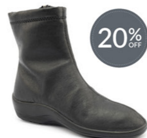
Jasper Black WAS $229.95 NOW $183.95