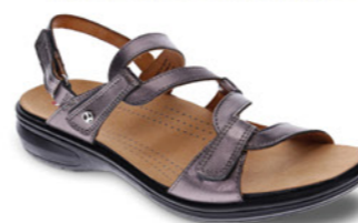
MIAMI Gunmetal WAS $189.95 NOW $161.45