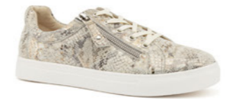
Cara Print Taupe Snake WAS $229.95 NOW $195.45