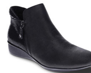
DAMASCUS Onyx/Black Lizard WAS $229.95 NOW $183.95