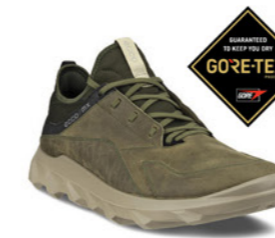
MX Grape Leaf also available in black WAS $279.95 NOW $237.95