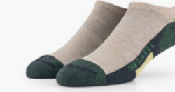
MOAB SPEED LOW CUT TAB NAVY $19.99 SINGLE PAIR PACK