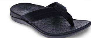
MEN'S WHACK WAS $69.95 NOW $59.45