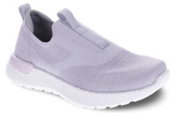
MAGGIE LAVENDER WAS $109.95 NOW $93.45