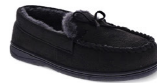
MOHICAN BLACK WAS $69.95 NOW $55.95