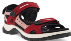
Offroad Chili Red WAS $239.95 NOW $203.95