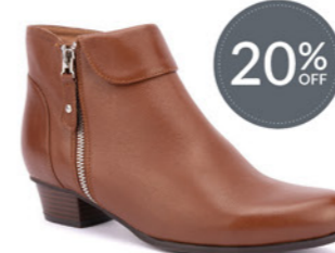
Xanthippe Cognac WAS $299.95 NOW $239.95