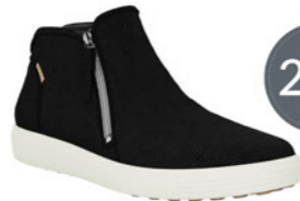
Soft 7 Boot Black WAS $299.95 NOW $239.95