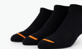
CUSHIONED COTTON LOW CUT TAB BLACK $19.99 THREE PAIR PACK