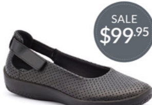
L58 Pierced Black WAS $179.95 NOW $99.95