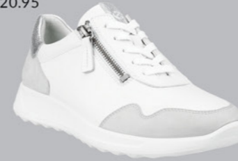
Flexure Runner Gravel White WAS $259.95 NOW $220.95