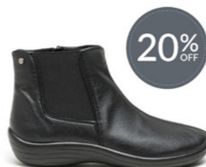
Trakai Black WAS $219.95 NOW $175.95