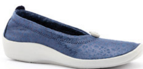
L14 Liho Blue WAS $159.95 NOW $135.95