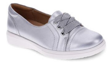
BRIDGETTE SILVER WAS $189.95 NOW $161.95