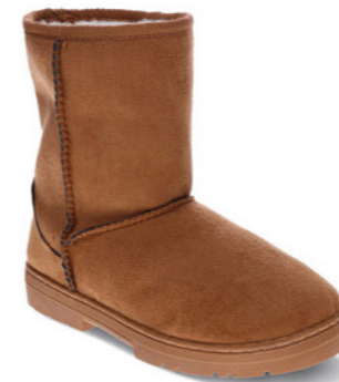
FAMOUS BROWN WAS $79.95 NOW $63.95