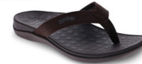
MEN'S WAVE WAS $69.95 NOW $59.45