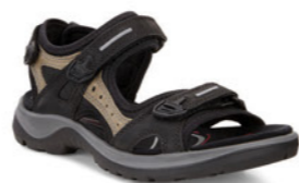
Offroad Black WAS $239.95 NOW $203.95