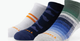
RECYCLED EVERYDAY TAB BLAST $29.99 THREE PAIR PACK