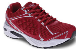
WOMEN'S SPRINTER RED WAS $129.95 NOW $110.45