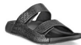
Cozmo Black WAS $209.95 NOW $178.45