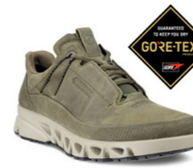
Multi-Vent Grape Leaf WAS $399.95 NOW $339.95