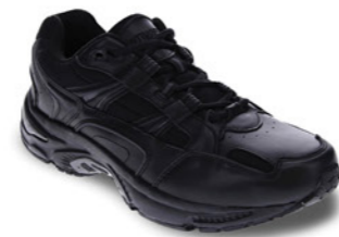
UNISEX X-TRAINER BLACK WAS $129.95 NOW $110.45