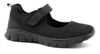
Kross Strap Double Black WAS $119.95 NOW $101.95