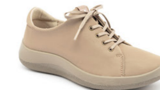
Daintree Taupe WAS $249.95 NOW $212.45