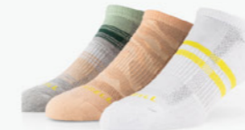
RECYCLED EVERYDAY TAB PEACH ASSORTED $29.99 THREE PAIR PACK