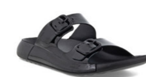
Cozmo Black Patent WAS $209.95 NOW $178.45