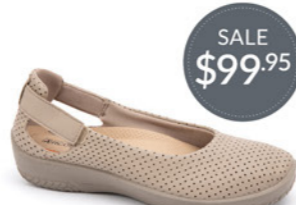
L58 Pierced Taupe WAS $179.95 NOW $99.95