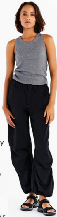
Offroad Black WAS $239.95 NOW $203.45