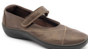
Triglav Bronze WAS $179.95 NOW $152.95