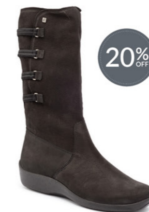
Citrus Montana Black WAS $349.95 NOW $279.95