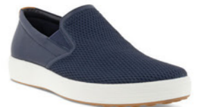
Soft 7 Slip On Black WAS $279.95 NOW $237.95