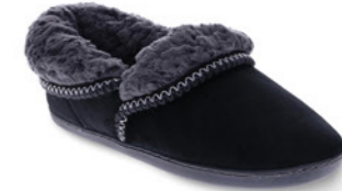
SNUGGLE BLACK WAS $59.95 NOW $47.95