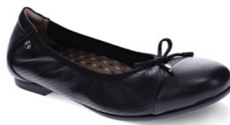
ST BARTS Black French WAS $189.95 NOW $161.45