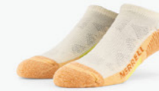
MOAB SPEED LOW CUT TAB PEACH $19.99 SINGLE PAIR PACK