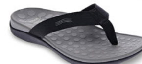
MEN'S WAVE WAS $69.95 NOW $59.45