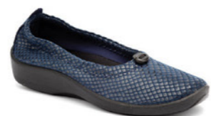
L14 Diamond Navy WAS $159.95 NOW $135.95