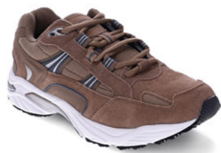
UNISEX X-TRAINER STONE WAS $129.95 NOW $110.45