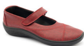
Triglav Cherry WAS $179.95 NOW $152.95