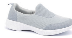
Kross Walk Grey WAS $119.95 NOW $101.95