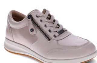
BOSTON Champagne/Pebble WAS $209.95 NOW $178.45