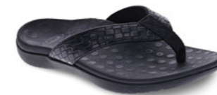
SONOMA BLACK BRICK WAS $69.95 NOW $59.45