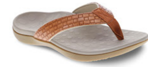
SONOMA BROWN BRICK WAS $69.95 NOW $59.45