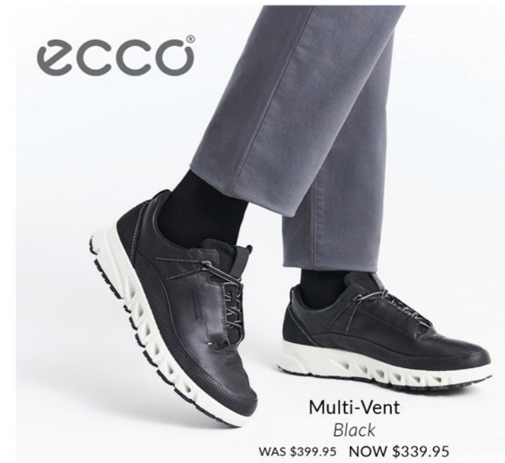
Multi-Vent Black WAS $399.95 NOW $339.95

Men's footwear available in selected stores.