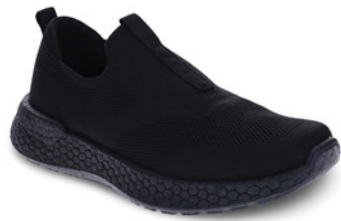
MAGGIE BLACK/BLACK WAS $109.95 NOW $93.45