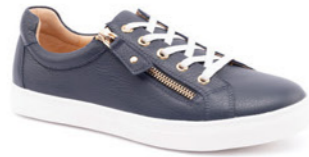
Cara Pebble Navy WAS $229.95 NOW $195.45