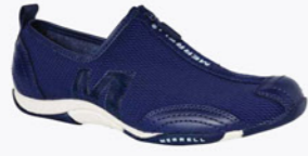
J73702 BARRADO - NAVY NAVY WAS $149.95 NOW $99.95