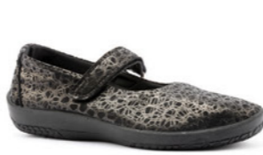
L45 Liho Black WAS $169.95 NOW $144.95