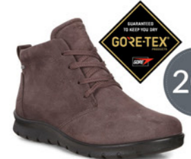
Babbett Boot Shale WAS $319.95 NOW $255.95