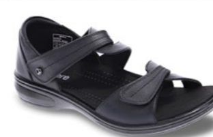
GENEVA Black WAS $199.95 NOW $169.45