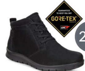
Babbett Boot Black WAS $319.95 NOW $255.95