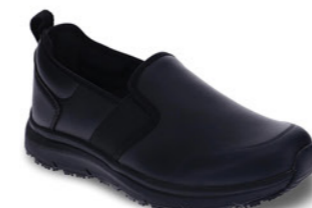
WORKER PU BLACK WAS $129.95 NOW $110.45