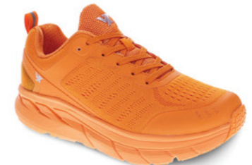
VX WALKER TANGERINE WAS $159.95 NOW $135.95