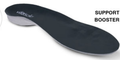
EVERYDAY ACTIVE 3/4 LENGTH WAS $49.95 NOW $42.45