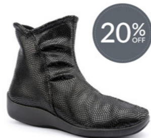
L19 Creative Black WAS $229.95 NOW $183.95