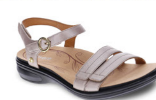
BARBADOS Champagne WAS $189.95 NOW $161.45