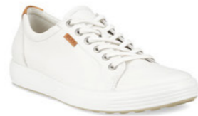
Soft 7 White WAS $289.95 NOW $246.95