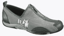
J503462 BARRADO - GRANITE GRANITE WAS $149.95 NOW $99.95