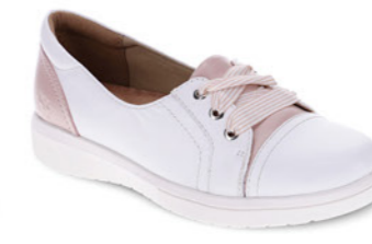
BRIDGETTE WHITE BLUSH WAS $189.95 NOW $161.95