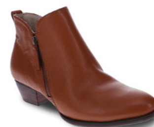
DELTA Cognac WAS $249.95 NOW $199.95