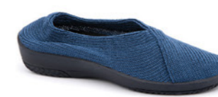
Mailu Sport Denim WAS $119.95 NOW $101.95