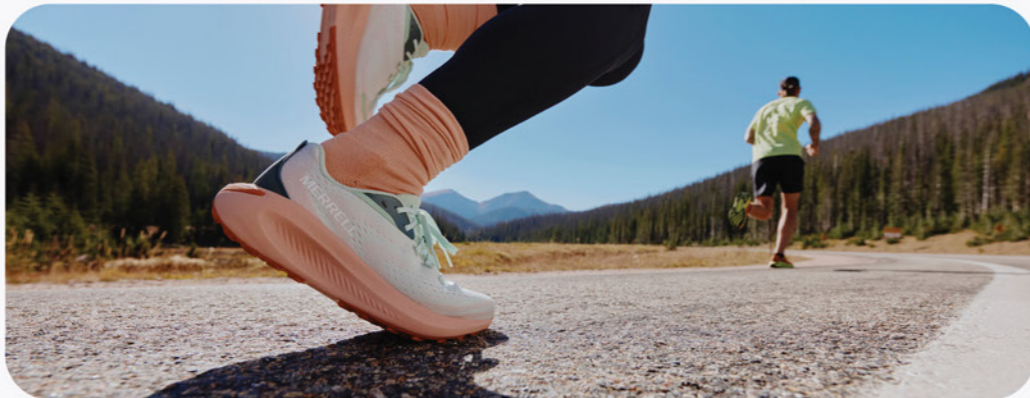
J068230 W MORPHLITE WHITE/MULTI WAS $149.95 NOW $119.95