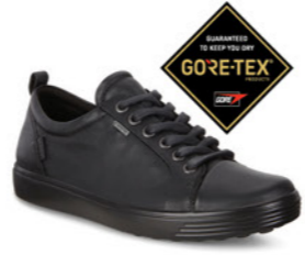
Soft 7 GTX Black WAS $299.95 NOW $254.95