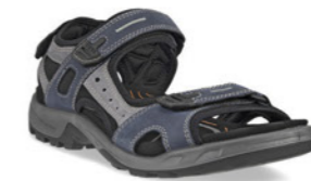
Offroad Marine WAS $239.95 NOW $203.95