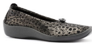
L14 Liho Black WAS $159.95 NOW $135.95