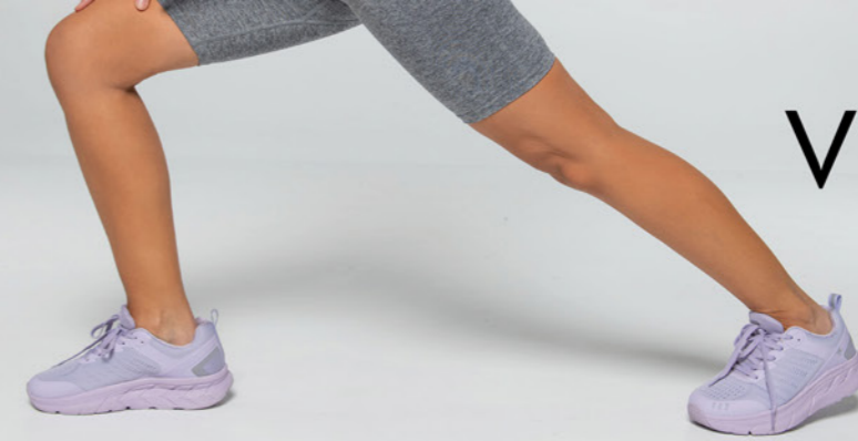
VX Walker LAVENDER WAS $159.95 NOW $135.95