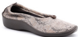
L14 Grey Snake WAS $159.95 NOW $135.95