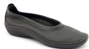
Gauja Black WAS $159.95 NOW $135.95