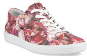
Soft 7 Multicolour WAS $279.95 NOW $237.95