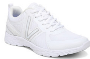
MILES II White WAS $179.95 NOW $152.95