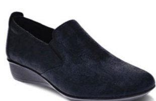
JAMAICA Black Angle WAS $199.95 NOW $169.95