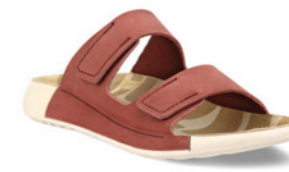
Cozmo Petal Trim WAS $199.95 NOW $169.95