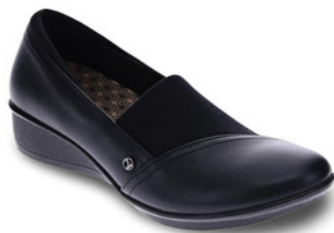
NAPLES Black French WAS $189.95 NOW $161.45