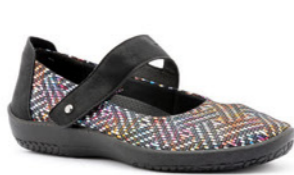
Cosmo Kokoa Black WAS $179.95 NOW $152.95