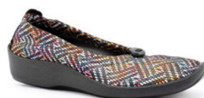
L14 Kokoa Black WAS $159.95 NOW $135.95