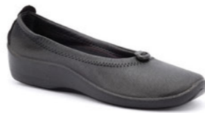
L1 Black WAS $159.95 NOW $135.95