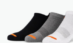
CUSHIONED COTTON LOW CUT TAB BLACK ASSORTED 1 $19.99 THREE PAIR PACK