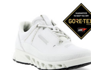
Multi-Vent White WAS $399.95 NOW $339.95