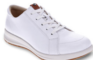
ATHENS Coconut WAS $199.95 NOW $169.95

ALL YOUR FAVOURITE REVERE SANDALS AVAILABLE IN A VARIETY OF COLOURS