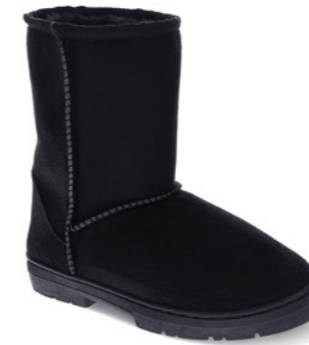
FAMOUS BLACK WAS $79.95 NOW $63.95