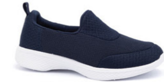
Kross Walk Navy WAS $119.95 NOW $101.95