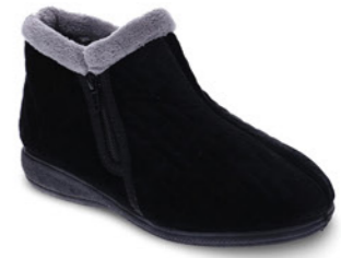
DAHLIA BLACK WAS $69.95 NOW $55.95