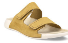
Cozmo Cayote WAS $199.95 NOW $169.95

The added functional side-zip detail is both practical for ease of entry and fashionable for a bit of flair.