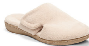
GEMMA Tan WAS $99.95 NOW $79.95