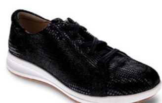
ATHENS Black Lizard WAS $199.95 NOW $169.95