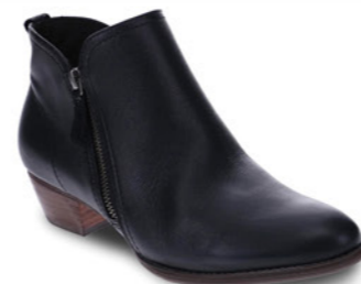
DELTA Blue French WAS $249.95 NOW $199.95