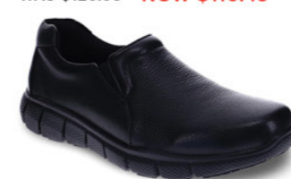
JOHN BLACK WAS $159.95 NOW $135.95