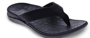
MEN'S WHACK WAS $69.95 NOW $59.45