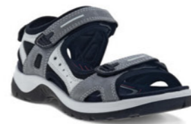
Offroad Titanium WAS $239.95 NOW $203.95