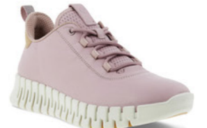
Gruuv Violet Ice / Powder WAS $299.95 NOW $254.95