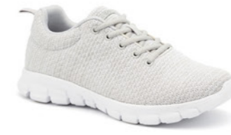
Kross Sport Silver WAS $119.95 NOW $101.95