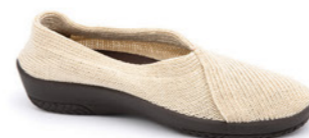
Mailu Sport Beige WAS $119.95 NOW $101.95