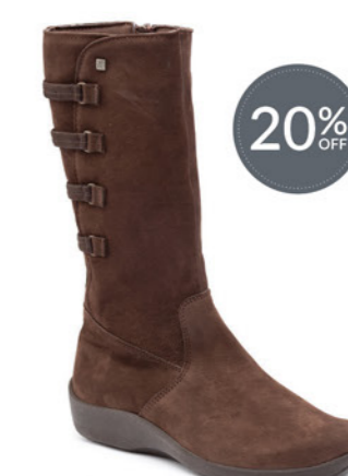
Citrus Montana Brown WAS $349.95 NOW $279.95