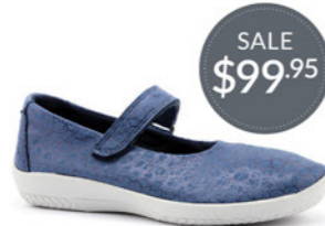
L45 Liho Blue WAS $179.95 NOW $99.95