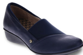
NAPLES Sapphire WAS $189.95 NOW $161.45