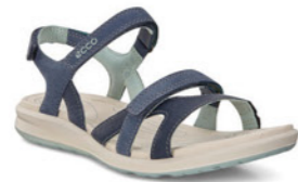
Cruise Navy WAS $229.95 NOW $195.45