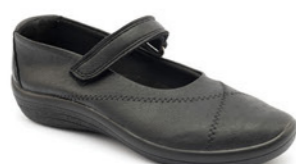
Triglav Black WAS $179.95 NOW $152.95