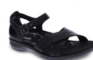
LUCEA Black French WAS $189.95 NOW $161.45