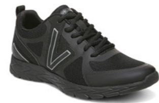
MILES II Black/Charcoal WAS $179.95 NOW $152.95