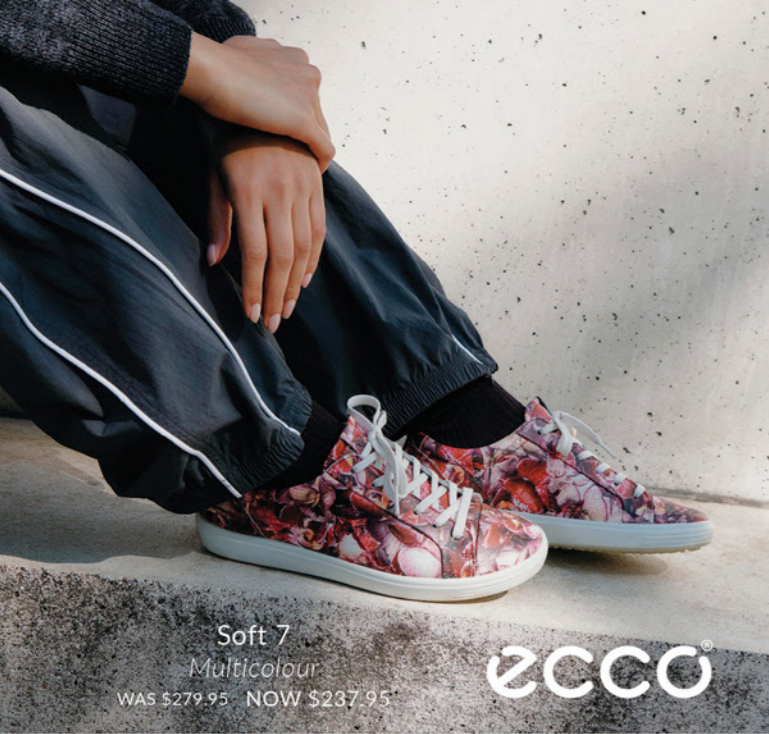
Soft 7 Multicolour WAS $279.95 NOW $237.95