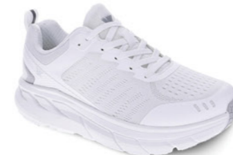
VX WALKER WHITE WAS $159.95 NOW $135.95