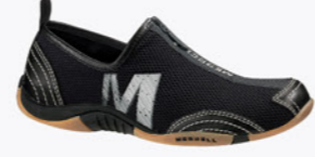
J73426 BARRADO - BLACK BLACK WAS $149.95 NOW $99.95