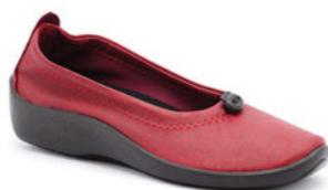
L1 Cherry WAS $159.95 NOW $135.95