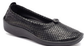
L14 Diamond Black WAS $159.95 NOW $135.95