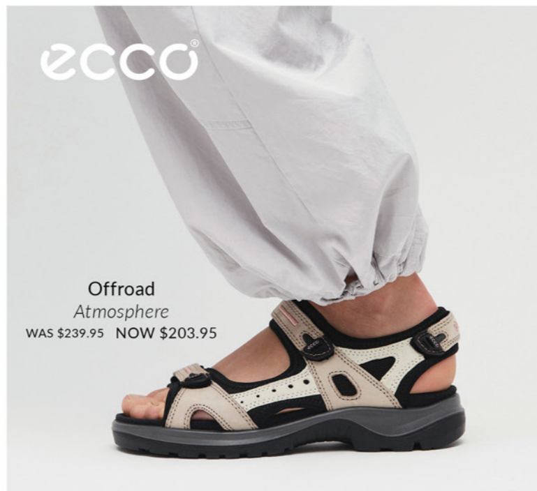
Offroad Atmosphere WAS $239.95 NOW $203.95