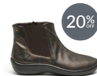
Trakai Bronze WAS $219.95 NOW $175.95