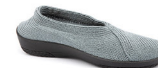
Mailu Sport Titanium WAS $119.95 NOW $101.95