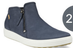
Soft 7 Boot Marine WAS $299.95 NOW $239.95