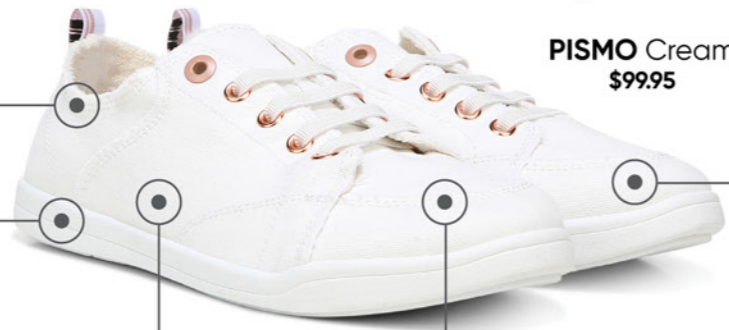
PISMO Cream $99.95