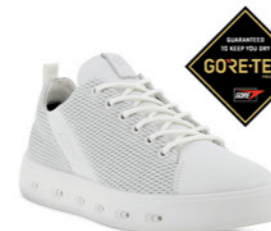
Street 720 White WAS $329.95 NOW $280.45