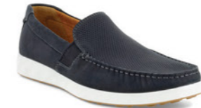
S Lite Moc Andorra WAS $249.95 NOW $212.45