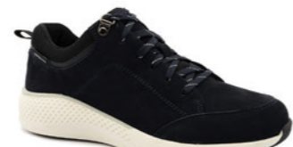
Kiama Navy WAS $179.95 NOW $152.95