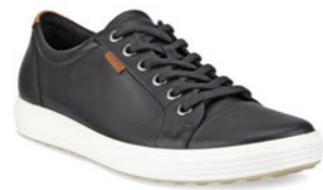
Soft 7 Black WAS $289.95 NOW $246.95