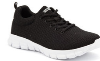
Kross Sport Black WAS $119.95 NOW $101.95