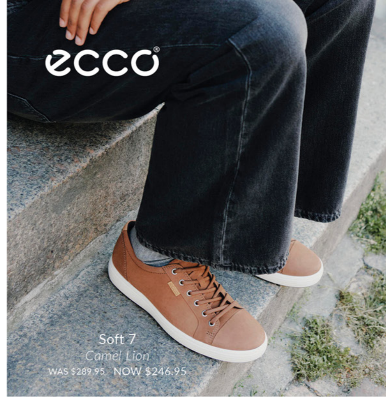
Soft 7 Camel Lion WAS $289.95 NOW $246.95