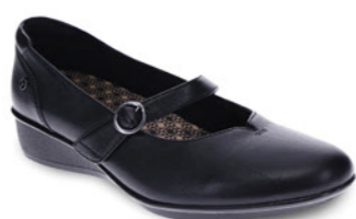
SICILY Black French WAS $199.95 NOW $169.95