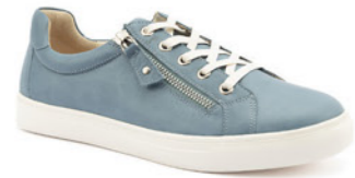
Cara Plain Jeans WAS $229.95 NOW $195.45