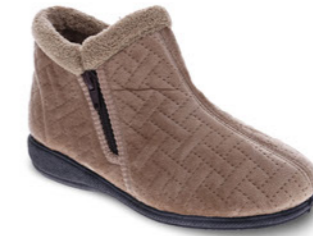
DAHLIA TAUPE WAS $69.95 NOW $55.95