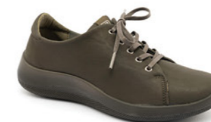
Daintree Khaki WAS $249.95 NOW $212.45