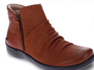
SALZBURG Cognac WAS $229.95 NOW $183.95