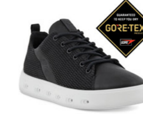
Street 720 Black WAS $329.95 NOW $280.45