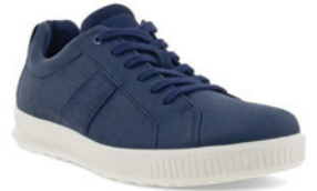
Byway Night Sky WAS $239.95 NOW $203.95