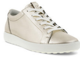
Soft 7 Gold Metallic WAS $279.95 NOW $237.95