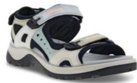
Offroad Multicolour Sage WAS $239.95 NOW $203.95