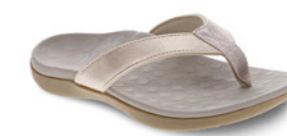
SONOMA SMOOTH GOLD WAS $69.95 NOW $59.45