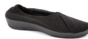
Mailu Sport Black WAS $119.95 NOW $101.95