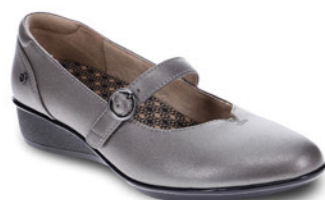
SICILY Slate WAS $199.95 NOW $169.95

Don't stand for ill-fitting, painful shoes any longer. Keep moving forward with revere.