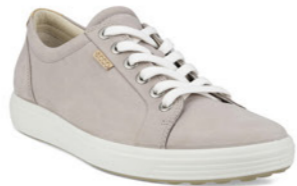
Soft 7 Grey Rose WAS $289.95 NOW $246.95