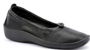
L14 Creative Black WAS $159.95 NOW $135.95