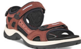
Offroad Andorra WAS $239.95 NOW $203.95