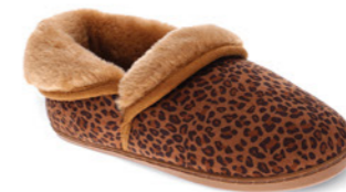
SNUGGLE NATURAL LEOPARD WAS $59.95 NOW $47.95