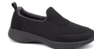
Kross Walk Double Black WAS $119.95 NOW $101.95