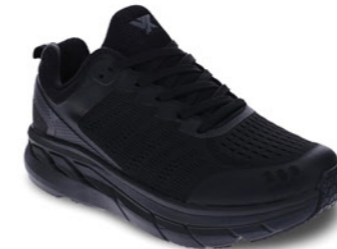
VX WALKER BLACK WAS $159.95 NOW $135.95