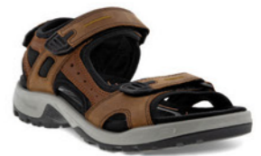
Offroad Espresso Cocoa Brown WAS $239.95 NOW $203.95