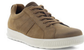
Byway Camel WAS $239.95 NOW $203.95