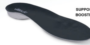
EVERYDAY COMFORT FULL LENGTH WAS $49.95 NOW $42.45