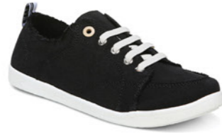
PISMO Black WAS $99.95 NOW $84.95