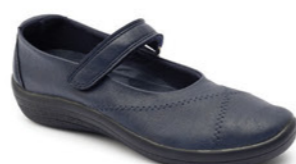
Triglav Navy WAS $179.95 NOW $152.95