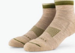
ZONED HIKING QUARTER KHAKI $19.99 SINGLE PAIR PACK