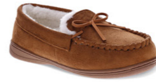
MOHICAN BROWN WAS $69.95 NOW $55.95