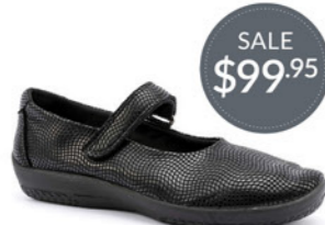
L45 Creative Black WAS $179.95 NOW $99.95