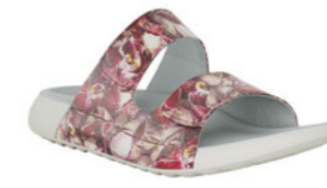
Cozmo Multi Flower WAS $209.95 NOW $178.45