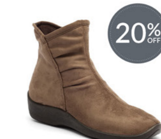
L19 Taupe WAS $219.95 NOW $175.95