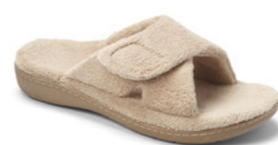
RELAX Tan WAS $99.95 NOW $79.95