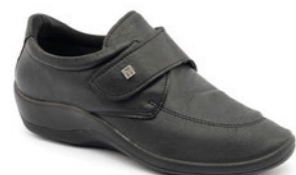
Repovesi Black WAS $199.95 NOW $169.95