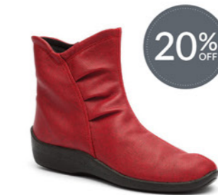
L19 Cherry WAS $219.95 NOW $175.95