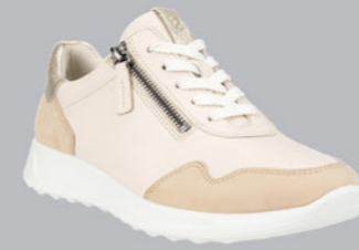
Flexure Runner Beige Limestone WAS $259.95 NOW $220.95