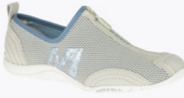
J503466 BARRADO - SILVER SEA SILVER SEA WAS $149.95 NOW $99.95