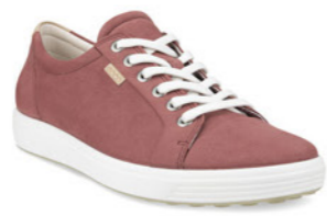
Soft 7 Petal Trim WAS $289.95 NOW $246.95