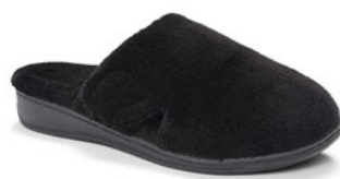
GEMMA Black WAS $99.95 NOW $79.95