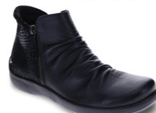
SALZBURG Black WAS $229.95 NOW $183.95