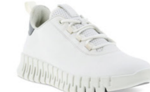
Gruuv White / Light Grey WAS $299.95 NOW $254.95