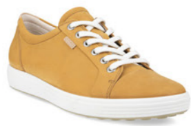
Soft 7 Cayote WAS $289.95 NOW $246.95