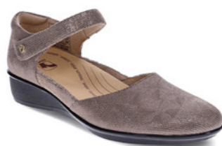
OSAKA Champagne Angle WAS $199.95 NOW $169.95