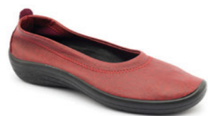
Gauja Cherry WAS $159.95 NOW $135.95