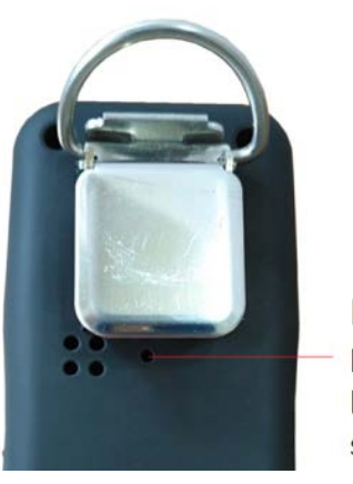
Pushing reset button through a hole on back of shell

Users can reset the unit by pushing a reset button through a hole on back of shell.