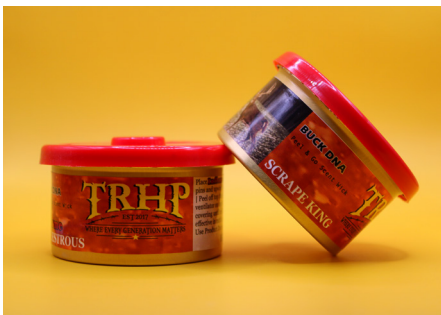
SCRAPE KING ENHANCER