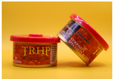
CURIOSITY SPECIALTY BLEND