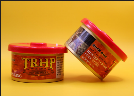
HUNTER'S CREED BUCK LURE

It's as easy as opening the can, setting the vent to max and placing the can in a hole covering until the red lid is slightly above the ground. All scent wick cans last up to two weeks and can be refreshed utilizing our bottled scents to last up to 30 days. .