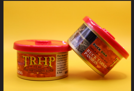
BUCK TARSAL PASSION