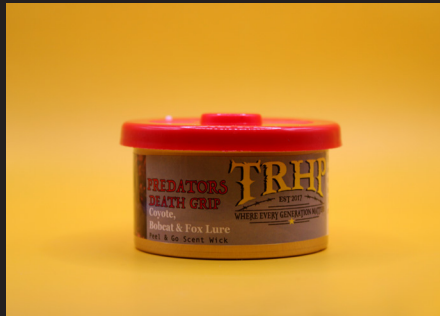
PREDATORS DEATH GRIP