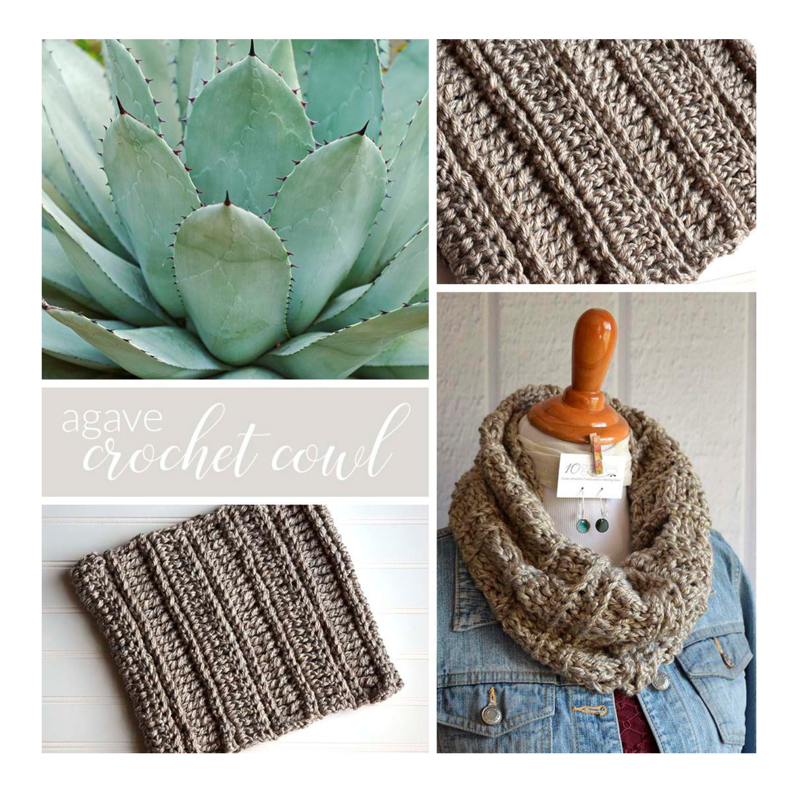
I'd love to see yours! Share on social media with @10gables and #golovely for a chance to be featured ©