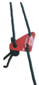
Metal Tension Adjusters