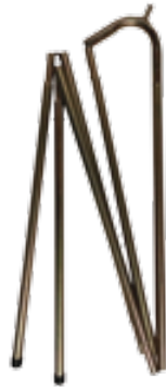
Door A-Frame (For 8')