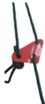
Metal Tension Adjusters