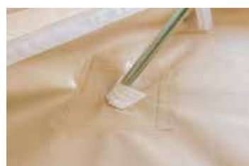
Floor Anchor Pocket for A-frame on both sides