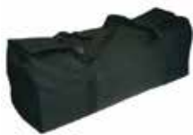
Waterproof Pole Bag

Waterproof Tent & Pole Bag (2) Pole Bag (1) Tool Kit Bag (1)