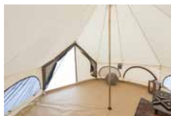
Center Pole and Door A-frame