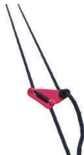
Metal Tension Adjusters