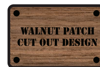
Walnut Cut Out (for eligible designs)