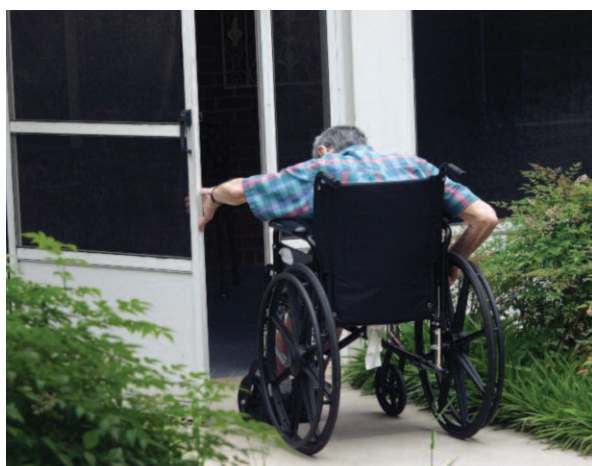
A difficult to open door can be as much of a barrier as a locked one for many residents

unlock in 15/30 seconds. If the verbiage is not written into the codes, and this is in a memory care area, make the language more complex so it is less of an enticement for residents to press the door handle. Then there are often other confusing signs about alarms or equipment that make it hard to determine if it is acceptable to go through a doorway. There may be doors where care community staff (or regulators) feel these signs are necessary, but the goal is to make sure there is easy access for residents to get outside. Try to have at least one door that actually invites residents to go outside, whenever they want, by not having signs that send mixed messages.