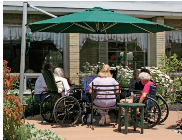
ST. JOHN NEWMAN