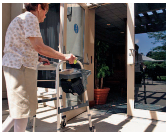
The ideal solution is a door with an automatic opener

Many doors to the outside do not open easily; they are heavy, or the seals are so tight to keep air out, that they are hard to open. The ideal solution is a door with an automatic opener, that stays open long enough for 1-2 people to move through the threshold and get outside easily, without the door closing on them. A difficult to open door can be as much of a barrier as a locked one for many residents.