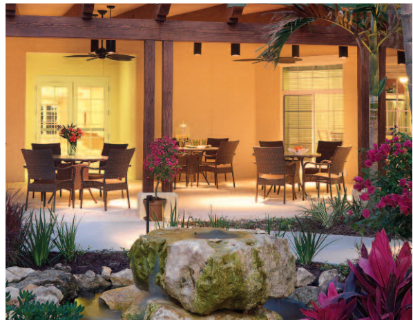
Having a transition area that is covered, like a porch, and has places to stop and sit, is important.