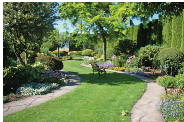
Path with options