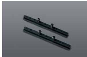
DUPLO LINEAR JOINT (PAIR)