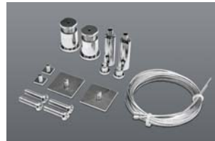
SUSPENSION (PAIR) SUSP 7 kit designed for all Profiles