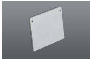
DUPLO END CAP Colours: Anodised, Black (30) & White (31)