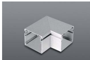
DUPLO TWO WAY COUPLING