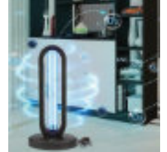
UVC and Ozone (O 3 )