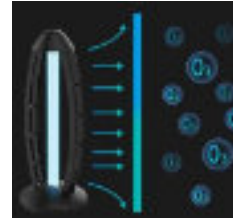
UVC and Ozone (O 3 )