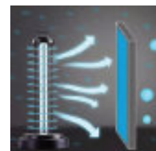
UVC and Ozone (O 3 )