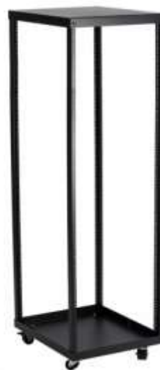
The image shows a part assembled Rollarak with profiles, top bottom and castors.