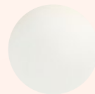
Grand Champion White