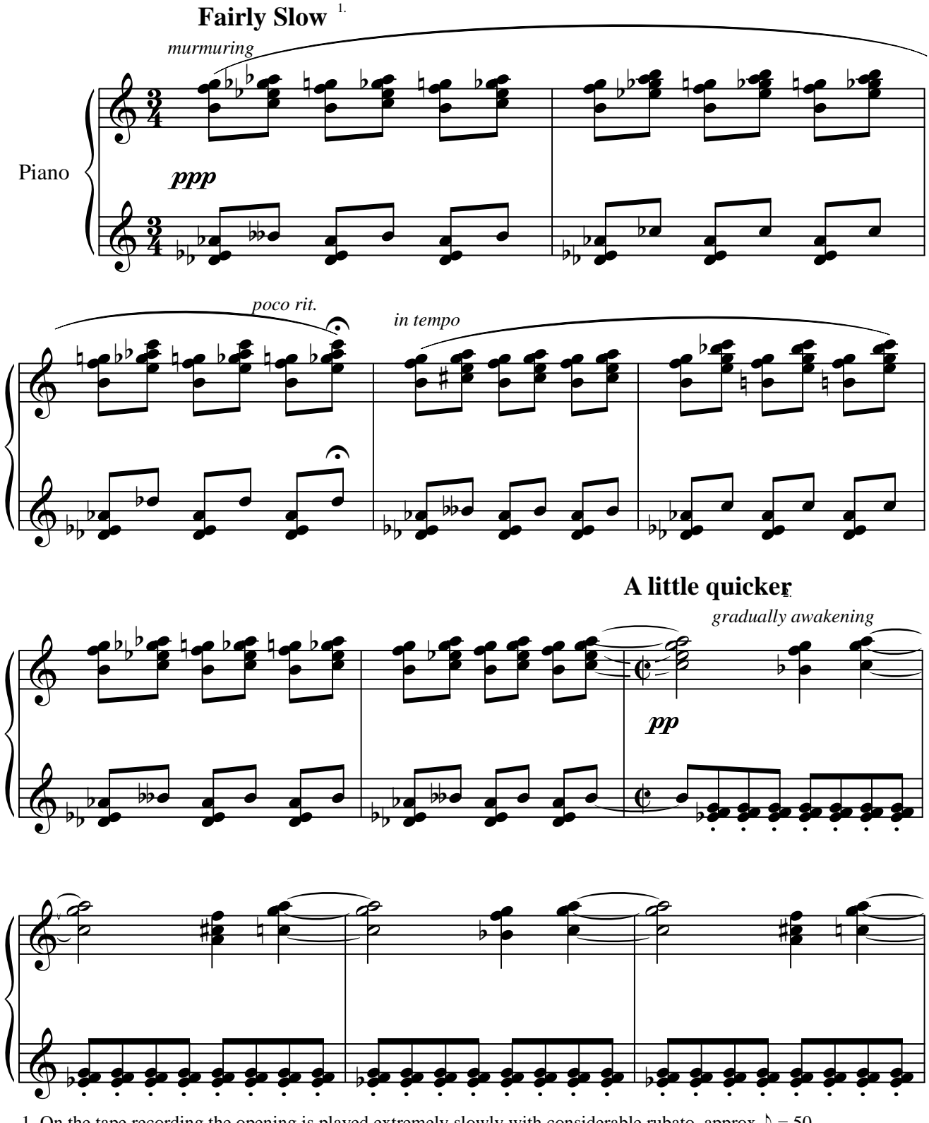
1. On the tape recording the opening is played extremely slowly with considerable rubato, approx h = 502. On the tape recording the composer plays this section in double time. That is, the crotchets are played at approximately the same speed as the quavers in the previous section.

Copyright © Estate Phillis Campbell 1925 Published by Wirripang Pty Ltd, March 2016. ISMNN 979 0 720167 25 1