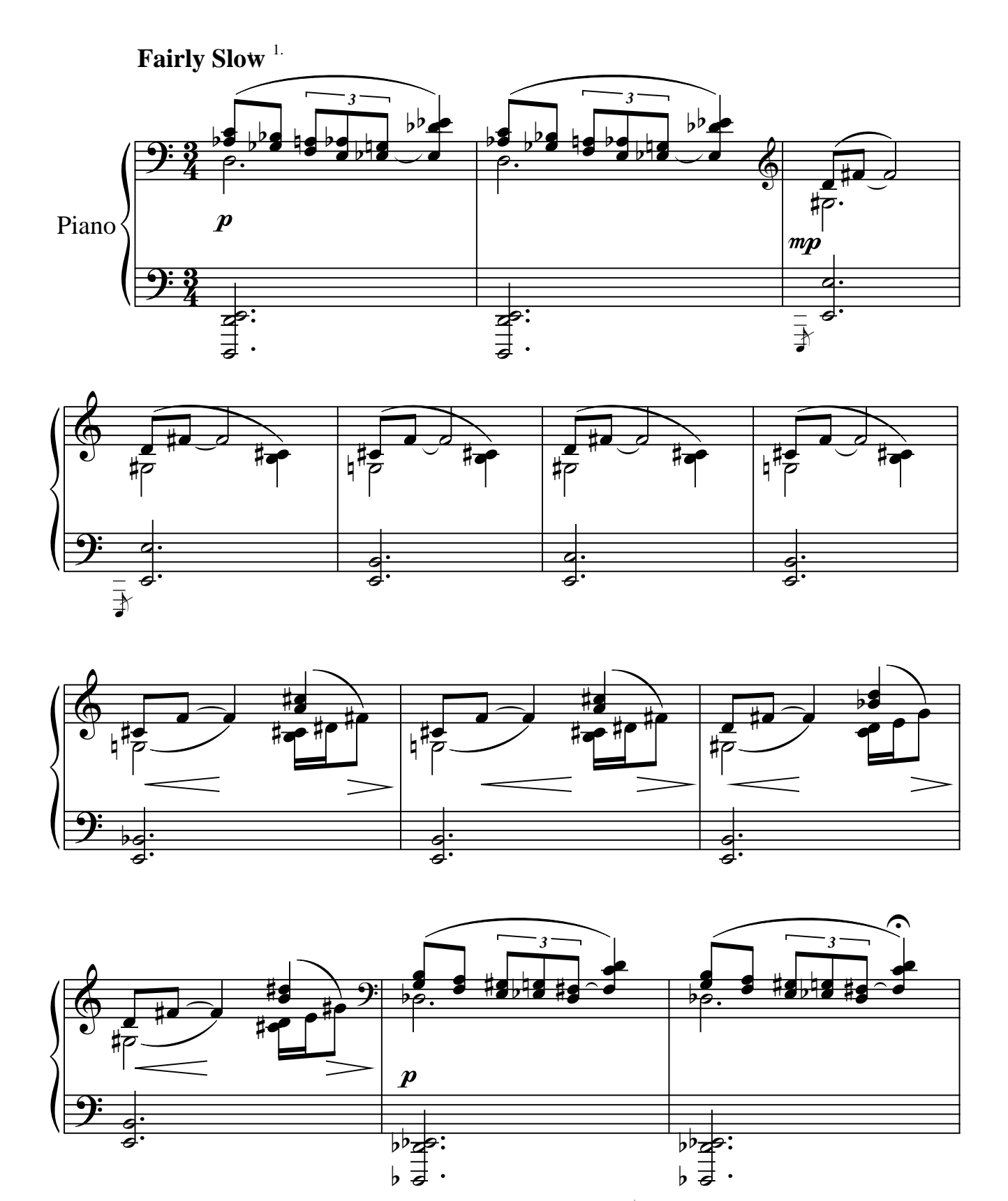
1. The composer plays this piece with considerable rubato, averaging about \bullet = 50 for the first section.

Copyright © Estate Phillis Campbell 1926 Published by Wirripang Pty Ltd, March 2016. ISMNN 979 0 720167 25 1