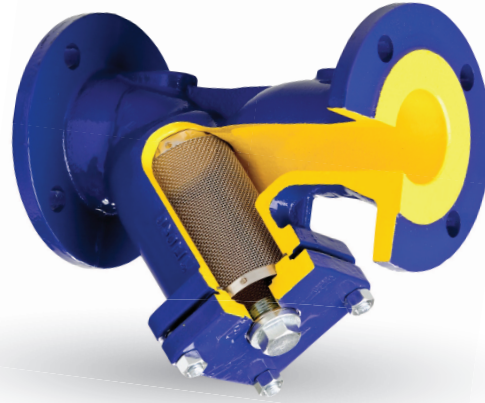
FIG 821 X - X