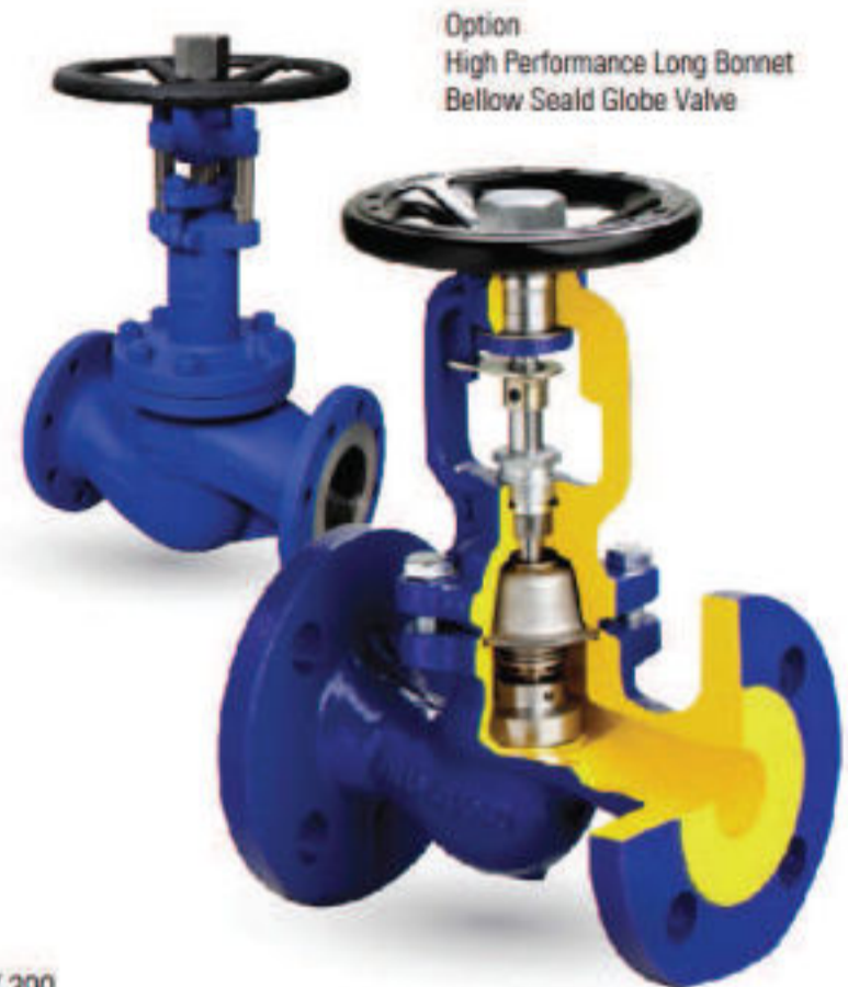
FIG 215M / 218M