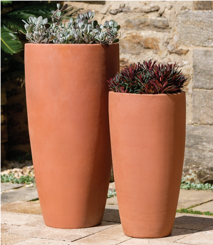
Shown in Terra Rosa