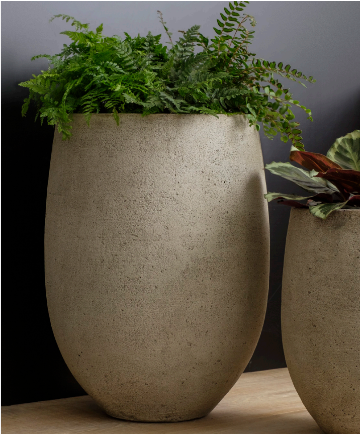
Shown in Alpine Stone