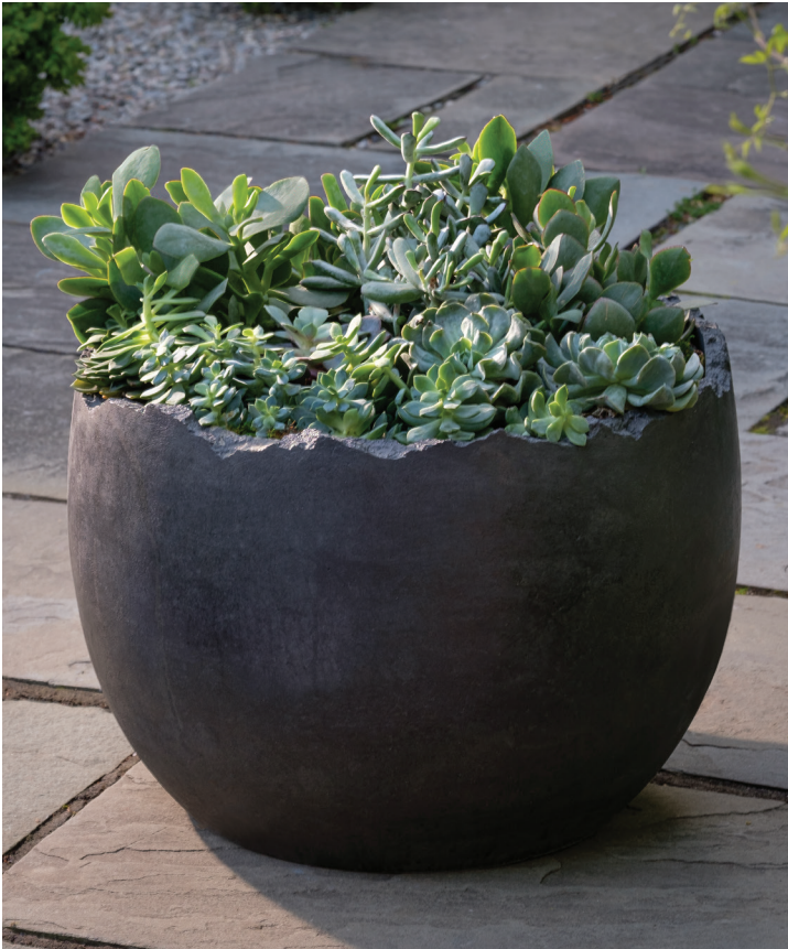
Shown in Lorem