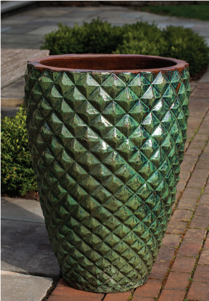
Shown in Rustic Green