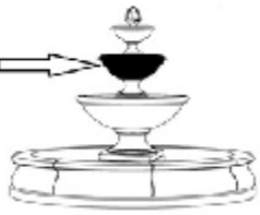
FT-269E (94 lbs) 29"W x 9.5"H