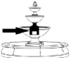
FT-269F (103 lbs) 13.5"W x 18"H