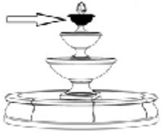
FT-269B (40 lbs) 20.25"W x 7"H

Professional installation is recommended for this fountain! Assemble your fountain on a level surface using crushed stone, gravel, or cement pad as the base.