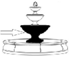
P-711 (535 lbs) 47"W x 26"H