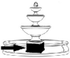
FT-269H (392 lbs) 24"L x 24"W x 15"H