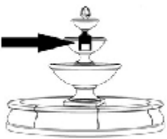
FT-269C (35 lbs) 9.25"W x 14"H