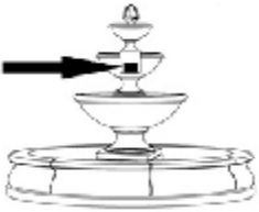
FT-269D (3 lbs) 5"L x 1.5"W x 4.5"H