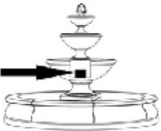
FT-269G (5 lbs) 6.25"L x 1.5"W x 5.25"H