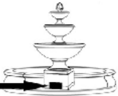
FT-269I (15 lbs) 7.75"L x 1.5"W x 7"H