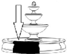
FT-124K (282 lbs each) 38"L x 9"W x 15"H