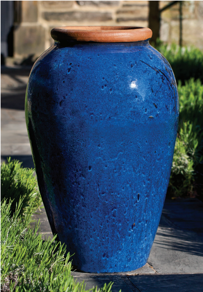
Shown in Rustic Blue