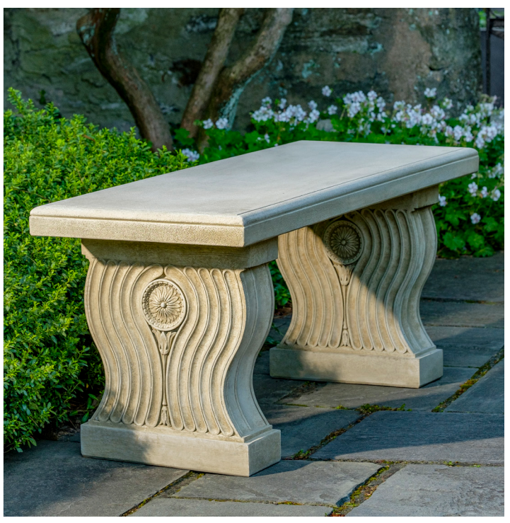
Shown in Verde