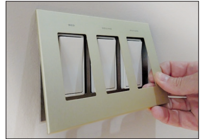
6. Snap on clean plate