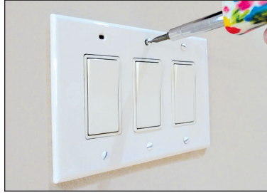
2. Remove old cover plate.