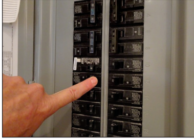
1. Turn off power.