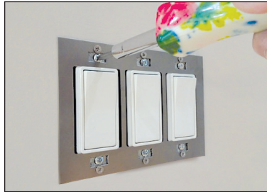
5. Adjust switches to level them out as needed.