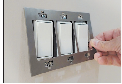
3. Align backing plate into place.