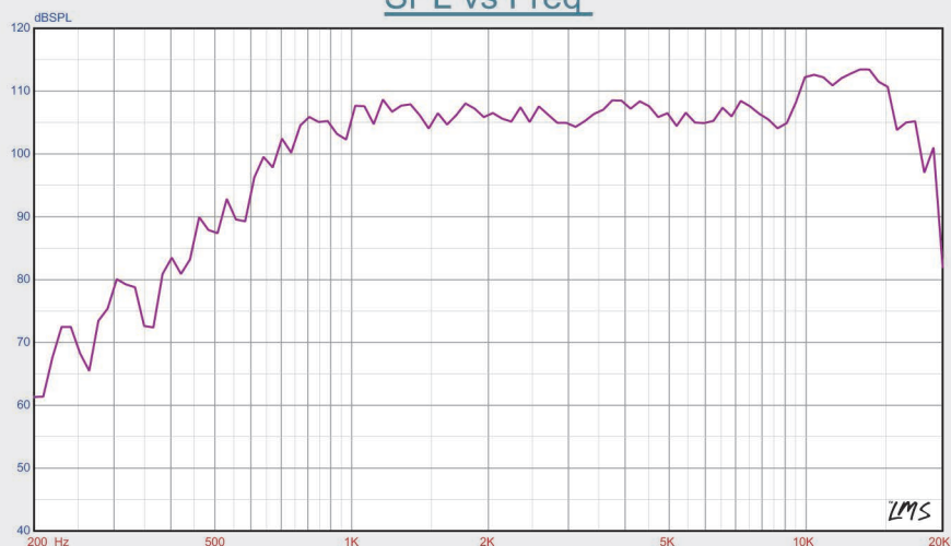
SPL vs Freq