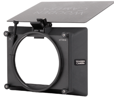
ZIP BOX PRO 4x5.65 (CLAMP ON) $399 SKU: 266500 - 267100