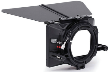
UMB-1 UNIVERSAL MATTEBOX (CLAMP ON)