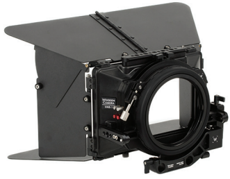
UMB-1 UNIVERSAL MATTEBOX (PRO)

The UMB-1 Universal Mattebox is designed to be user upgradeable. Each kit comes standard with two rotating 4x5.65 filter stages, individual tray catchers, folding French flag, 143mm diameter opening, & NATO standard accessory rails for attaching accessories.