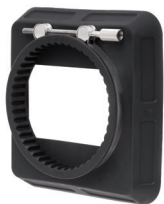
ZIP BOX 4x4 $49.50 SKU: 231400 - 231500

A lightweight rubber clamp on mattebox perfect for handheld or gimbal shooting available in three sizes.