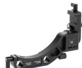
UNIVERSAL MATTEBOX TILT AND SWING AWAY ARM