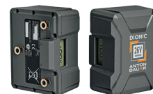
DIONIC 26V 98WH $650 SKU: 8675-0155