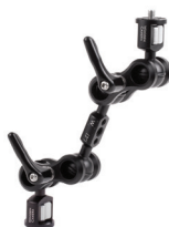
ULTRA ARM MONITOR MOUNT (1/4-20 TO 1/4-20, 3") $165 SKU: 232000