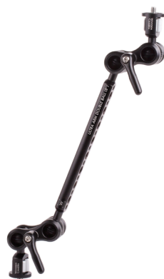
ULTRA ARM MONITOR MOUNT (1/4-20 TO 1/4-20, 8") $185 SKU: 232200