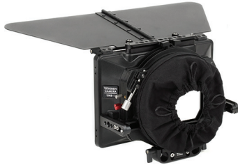
UMB-1 UNIVERSAL MATTEBOX (BASE)