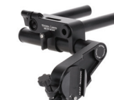
AIR EVF MOUNT $550 SKU: 253300