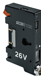
26V Gold Mount Plus $995 SKU: 273000