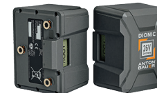
DIONIC 26V 240WH $890 SKU: 8675-0156