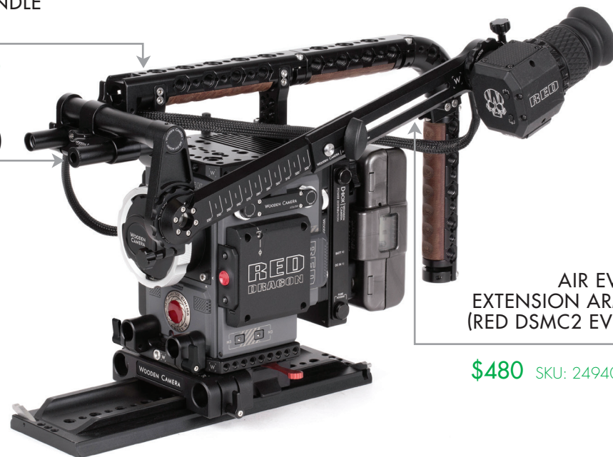
AIR EVF EXTENSION ARM (RED DSMC2 EVF)