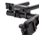
AIR EVF MOUNT $550 SKU: 248500