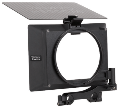
ZIP BOX PRO 4x5.65 (SWING AWAY) $499 SKU: 266400

Zip Box Pro is a high-quality mattebox with a simple design that is ready to work right out of the box, no tools or add-ons needed. It has the most robust set of features including three 4x5.65 filter slots, a carbon fiber top flag, and interchangeable backs weighing less than 1LB.