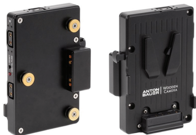
WC PRO GOLD MOUNT CAMERA SIDE TO V-MOUNT BATTERY SIDE ADAPTER $299 SKU: 259700