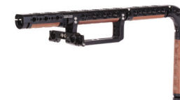
MASTER TOP HANDLE (UNIVERSAL CENTER SCREW CHANNEL) $995 SKU: 253100