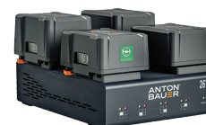
DUAL VOLTAGE QUAD CHARGER $1300 SKU: 8475-0138