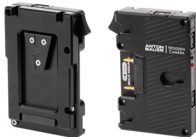
WC PRO V-MOUNT CAMERA SIDE TO GOLD-MOUNT BATTERY SIDE ADAPTER $299 SKU: 259600