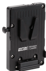
WC PRO V-MOUNT (3x D-TAP) $175 SKU: 257800