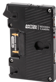
WC PRO GOLD MOUNT (3x D-TAP) $175 SKU: 257900

WC Pro Power Plates, a metal power plates created in partnership with Anton Bauer, which has a rugged aluminum body for durability and secure battery mounting. Features 3x D-Taps for accessory power, a digital fuse with reset button, rear cover plate, and captive mounting screws.