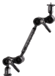
ULTRA ARM MONITOR MOUNT (1/4-20 TO 1/4-20, 5") $175 SKU: 232100