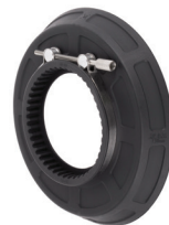
ZIP BOX 138mm ROUND $50 SKU: 242000 - 242300