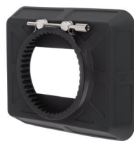
ZIP BOX DOUBLE 4x5.65 $125 SKU: 241600 - 241900