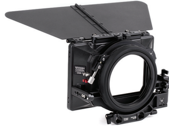
UMB-1 UNIVERSAL MATTEBOX (SWING AWAY)