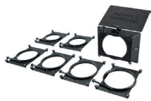
ZIP BOX PRO 4x5.65 FULL CLAMP ON KIT $995 SKU: 267200