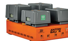
QUAD DISCHARGER $1050 SKU: 8475-0139