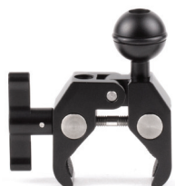
ULTRA ARM BALL (SUPER CLAMP) $85 SKU: 233100