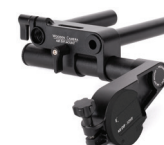
AIR EVF MOUNT $550 SKU: 259000