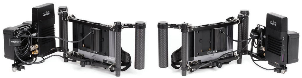
DUAL DIRECTION SWING AWAY BATTERY BRACKET