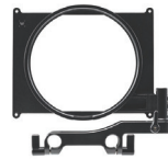
SWING AWAY BACK ONLY $185 SKU: 267300

SIZES: 80mm 85mm 87mm 95mm 100mm 104mm 110mm 114mm