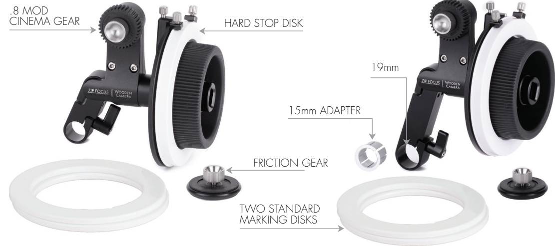
ZIP FOCUS (15mm LW FOLLOW FOCUS) $499 SKU: 255600

Zip Focus is a lightweight follow focus system, ideal for compact and handheld camera setups.