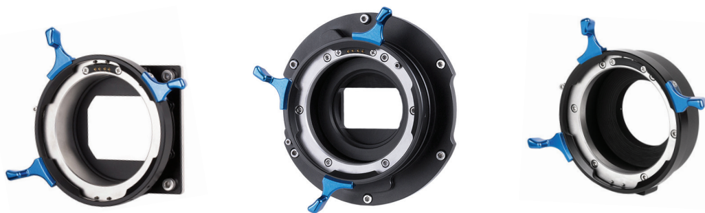
ARRI LPL MOUNT FOR RED DSMC2 CAMERAS $1,295 SKU: 263600

ARRI LPL Lens Adapters allow for ARRI Signature Prime Lenses to be used on a variety of cameras. Lens data can be accessed via LEMO style plug or rear pogo contacts depending on the adapter version.