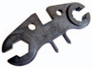
Field Tool - multiple functions, PN 1971903-1