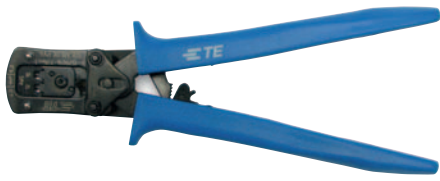
Crimping Tool, PN 6-1579014-8