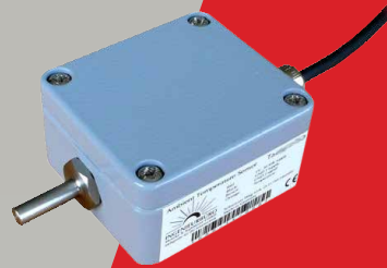
▶ Ambient Temperature sensor