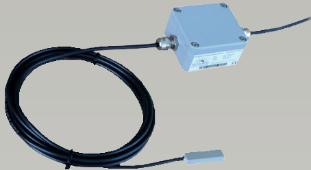
▶ Module Temperature sensor