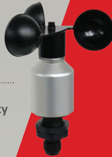
▶ Wind Velocity sensor