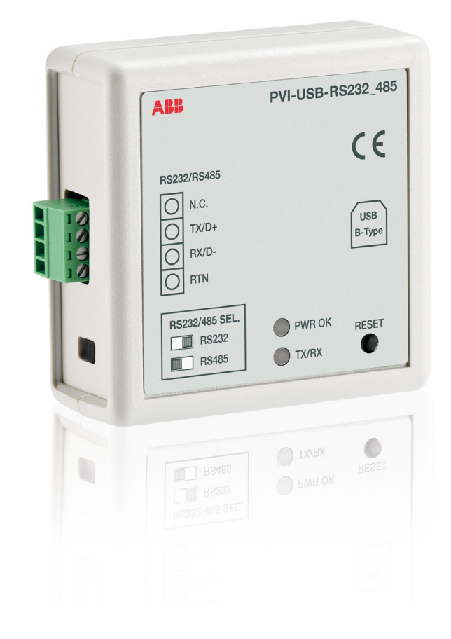
ABB monitoring and communications PVI-USB-RS232_485 Converter